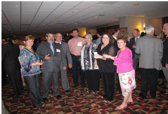
Chapter 28 Members outside the International Officers Installation Banquet