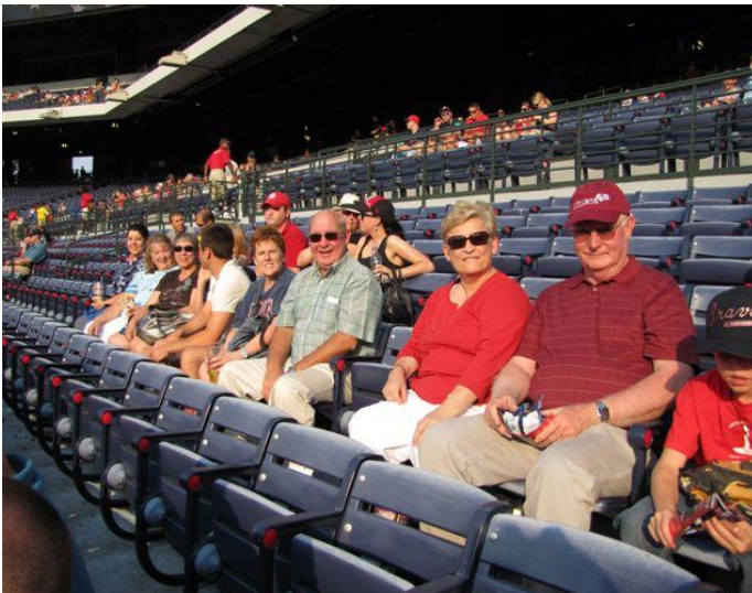
Chapter 28 & Region 1 members at Atlanta Braves Game