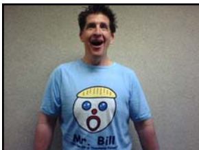
Oh No, Mr. Bill.....

RSVP Deadline: Thursday, November 8 th @ 5pm. No reservations will be taken after this date.